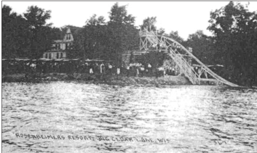
The water slide was a popular resort attraction.

bus or taxi to the various hotels on the lake. At the end of the 1915 season, about 2,300 people waited to board trains, a testament to the popularity of this area at one time. A fire destroyed the station in 1926.