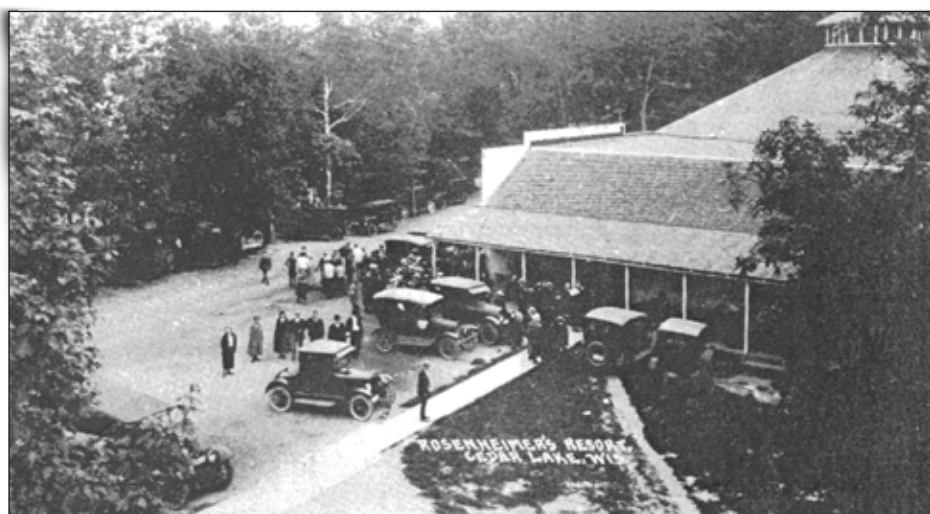
Rosenheimer's Resort pavilion and hotel complex in the mid-1920s.