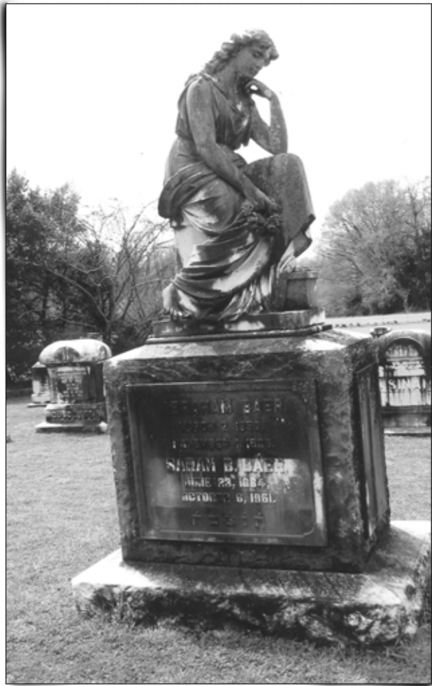
Anshe Chesed Cemetery

If you get the chance to visit the Civil War battlefield in Vicksburg, Miss., you can't help but see the Anshe Chesed Cemetery, situated on the Second Texas Lunette, an area of heavy fighting during the siege of Vicksburg in 1863. The cemetery had been at another location but was moved to its current site in 1864, 40 years before the creation of the Vicksburg National Military Park. The tombstones are very different from those you would see in Milwaukee. The Jewish community was comprised of families from Germanic areas of central and western Europe (Alsace-Lorraine, Baden and Bavaria) who began settling there in 1821. They were mainly merchants and peddlers who contributed to the growth of the Mississippi River towns into commercial centers.